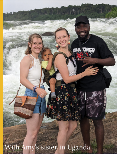
With Amy's sister in Uganda