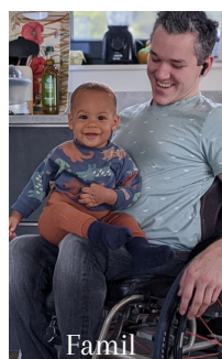
Reading books with oma