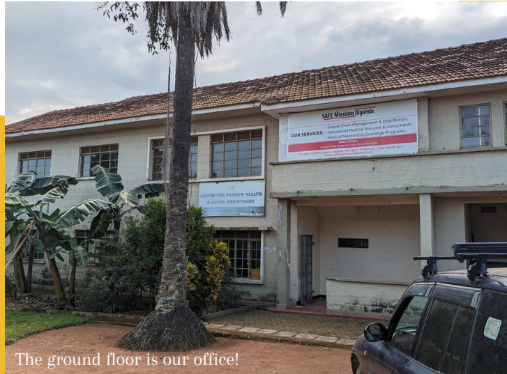
The ground floor is our office!