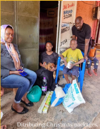
Distributing Christmas packages.